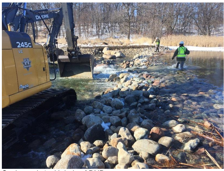
Setting weir 1 with help of DNR