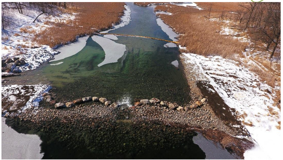
Weir 1 set.