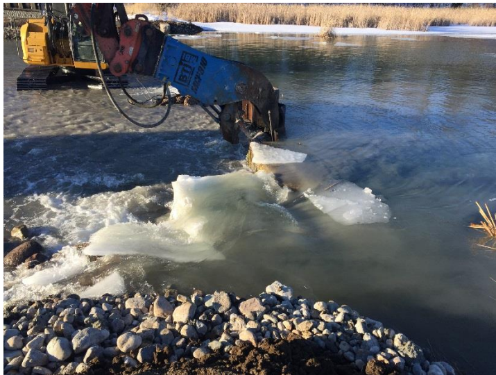
Cutting dam to elevation.