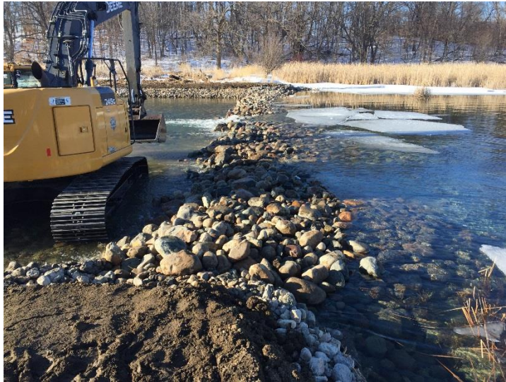
Dam to elevation, starting rock placement.