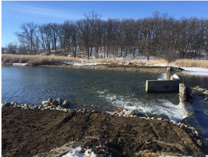
West berm built, starting east berm.