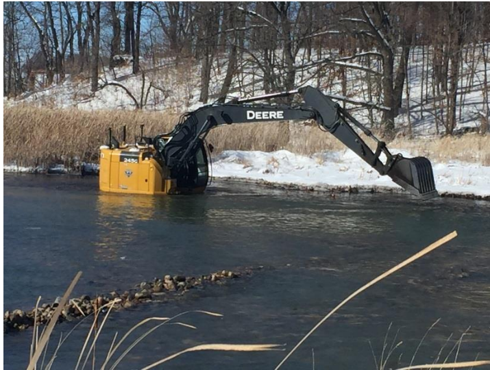
Excavating channel, west side.