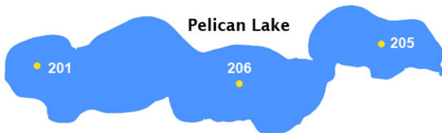
Figure 1. Pelican Lake monitoring site comparisons in phosphorus concentration.

The 2016 lake monitoring season showed better than average water quality at every site except 205. The clarity (Secchi depth) has averaged 4 feet higher than the long-term average in the past 2 years. This could be due to zebra mussels.